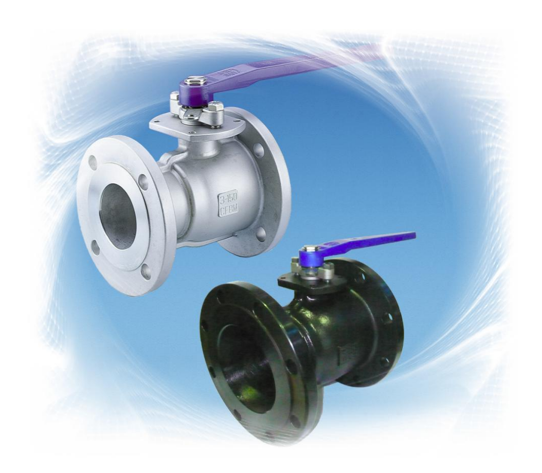
API-607 Fire Safe Certified Unibody Design Stainless and Carbon Steel in stock